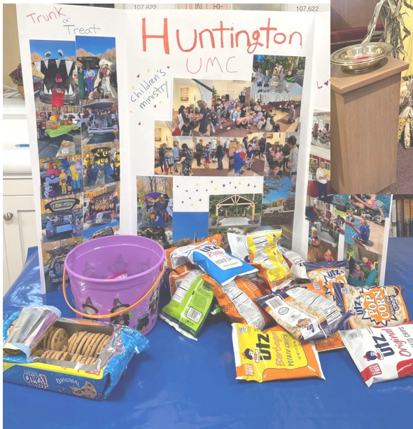
During our church conference